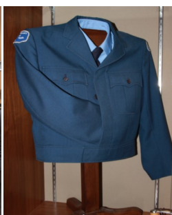
Drivers jacket on client-made stand