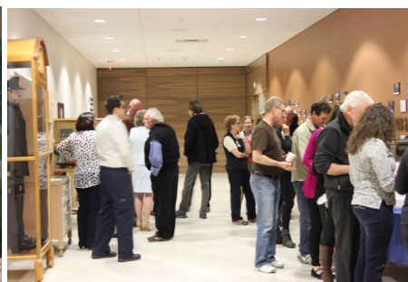
Attendees viewing History Walk displays